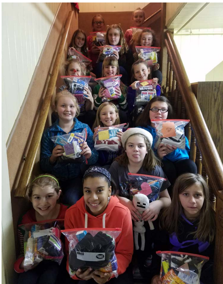
Girl Scout Troop 42123 created Blessings Bags which can be handed out to people in need. Each bag contained various items like hats, gloves, socks, toiletries, and other needs. It was a true team effort!