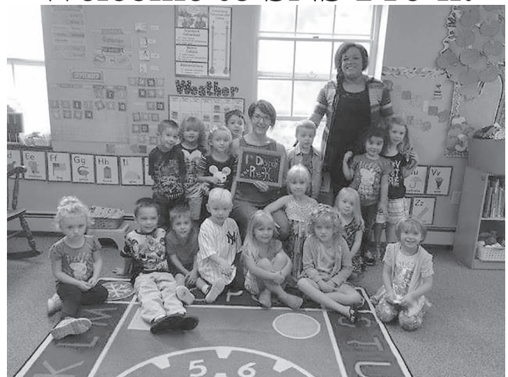
Sunshine Nursery School welcomes our new students to Pre-k. The students had fun exploring our room and getting to know one another. What a wonderful start to a new school year!