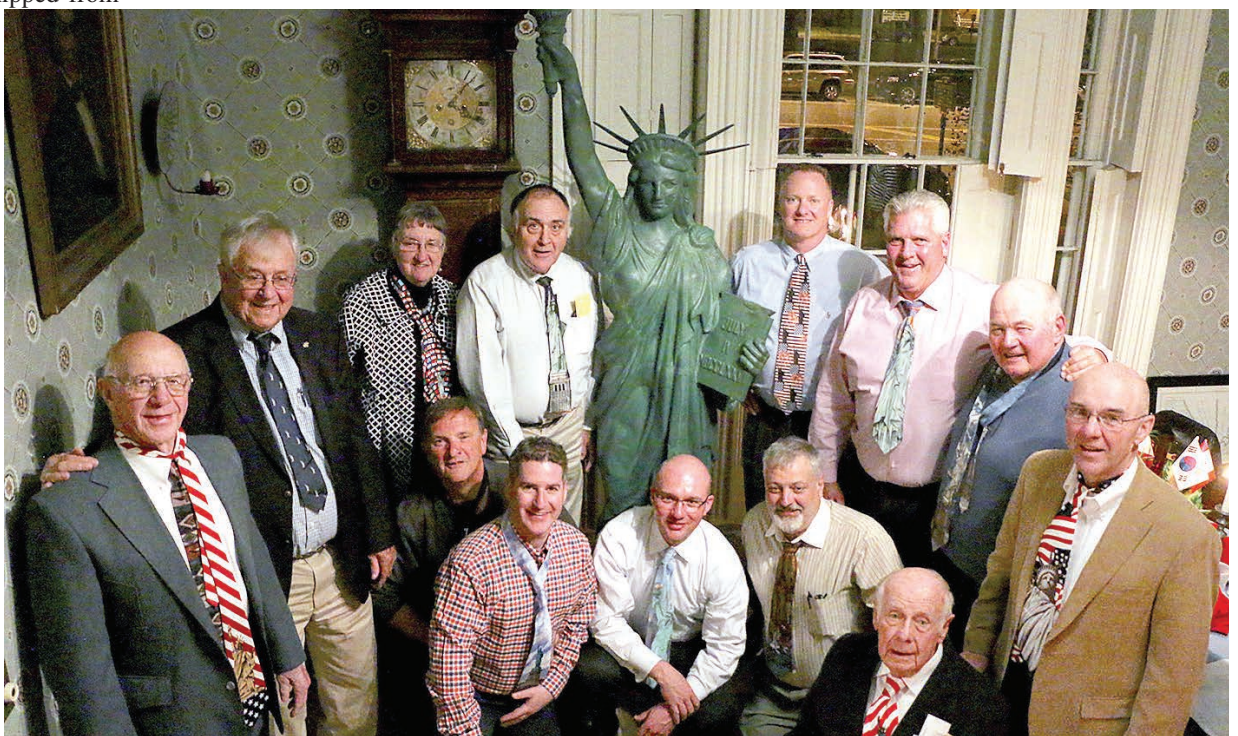
Strengthen the Arm of Liberty - these folks rented a Statue of Liberty tie for the night at LeRoy House and raised $300 to help restore LeRoy's Statue of Liberty.

tired, your poor, Your huddled masses yearning to breathe free, The wretched refuse of your teeming shore. Send these, the homeless, tempest-tost to me, I lift my lamp beside the golden door!"